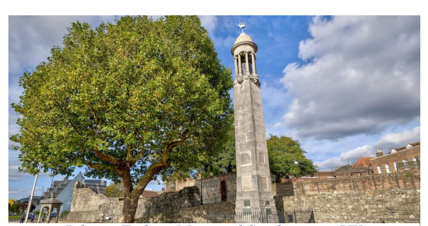
Pilgrim Fathers Memorial Southampton UK

Retrospective studies have inherent, sometimes insurmountable, biases, but speculation on past events by historians and anthropologists is commonplace and offers grist for future studies. Theories abound on what ailed famous historical figures both physical and mental, congenital and acquired. And so the CDC jumps into the fray and offers an alternative hypothesis for the cause of an