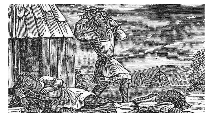
French Missionary Drawing of the Abenaki in Maine dying of European Disease

The Indian lifestyle, which included constant exposure to rodents and their droppings on land and in water, exposed them to the leptospiral life cycle. Bare feet were common in and around houses. Although a rare portal of entry, mucosal exposure may have occurred from ingestion of corn buried in the ground in rodent-accessible baskets and from rodent-contaminated foods in wigwams (weetas). Cuts and scrapes offered skin portals of entry. Attendance of the ill and burial of the dead (including those who died from Weil syndrome) would have attracted others who shared local food, water, and camp grounds. It was common practice for entire families to enter sweat lodges