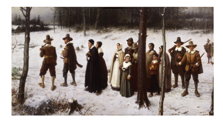
My Father's Daughter

Sometimes we need a little reminder of who we are. A beautiful song in tribute to all the generations who sacrificed so the next generation could have a better life. This song goes for mothers and sons too. The lyrics are beautiful enough but when listened to with the music, get the tissues.